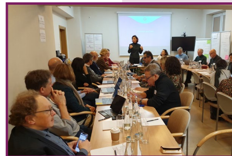
Strategy Meeting IIMCB, Poland October 2023

c140 people actively working on EU-LIFE Working Groups From 1.6 to 3.3 FTEs at the EU-LIFE office across the year