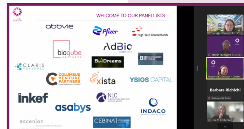
Tech Transfer Pitching Event October 2023