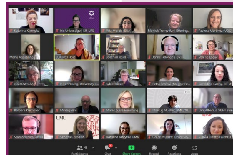
CoARA ACA WG Kick-off meeting October 2023