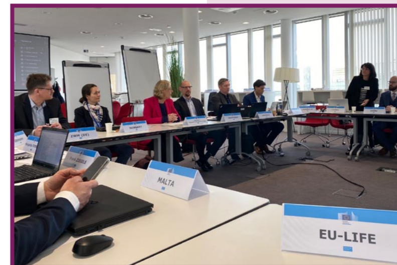
European Commission March 2023