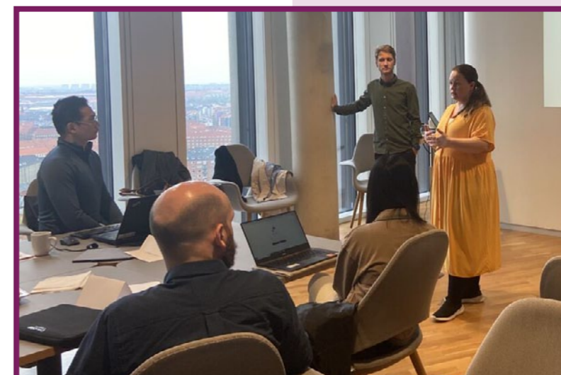
Storytelling workshop BRIC, Denmark April 2023

2 New working groups/initiatives launched: HR and post docs