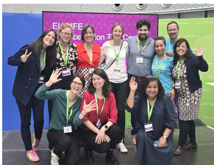
EU-LIFE Grants & Funding Working Group, Brno, 2025